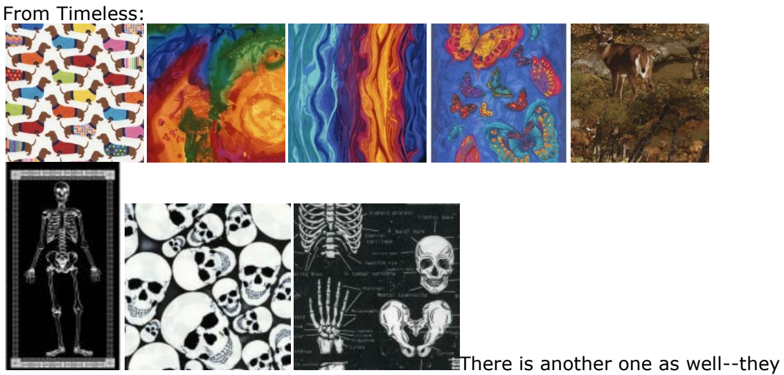
glow in the dark! From Moda: